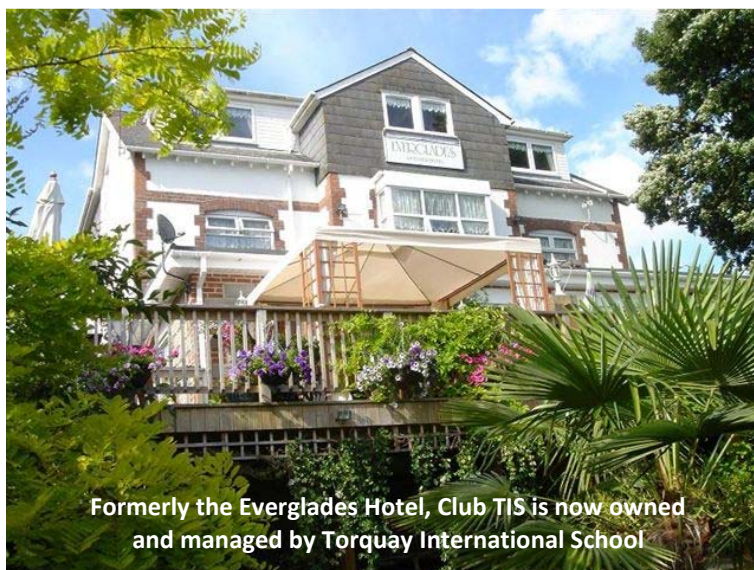
Formerly the Everglades Hotel, Club TIS is now owned and managed by Torquay International School

The Club TIS Study Centre is there for you to study or use the guest computer to check your email. Wireless internet (WIFI) is free of charge throughout the hotel.